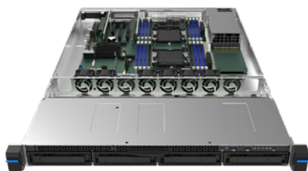
Intel® Server System M20MYP