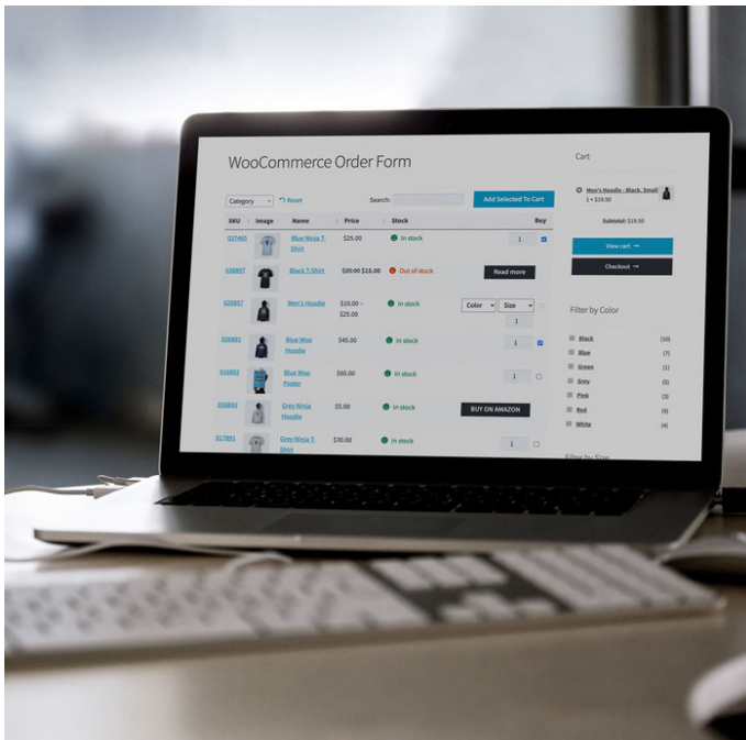
Barn2 is a Kinsta customer taking advantage of Google's C2 instances based on Intel Xeon Scalable processors for the e-commerce plugins they develop for WordPress.

Additionally, security was a key concern. Kinsta is able to ensure segregation among its customers with complete isolation between WordPress installations. By upgrading to the C2 machines, the company solved many challenges, while improving overall page load performance for customers. But migrating an entire customer base from one configuration to another is a large undertaking, even for a seasoned hosting provider.