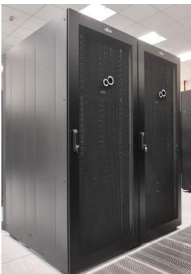
Intel Optane persistent memory along with 2nd Generation Intel Xeon Scalable processors deliver a flexible B-APM architecture for servers.

EPCC's new research cluster built by Fujitsu provided computing resources for NEXTGenIO research. In an intensive co-creation process, Fujitsu analyzed NEXTGenIO partners' application I/O and compute requirements and designed and manufactured the NEXTGenIO system focused to overcome existing bottlenecks. The cluster houses 34 nodes of dual-socket 2nd Generation Intel Xeon Platinum 8260 processors, 3 TBs of Intel Optane persistent memory, and 192 GB of DRAM per node. A 100 Gbps Cornelis Network fabric connects the compute nodes, while a 56 Gbps InfiniBand network attaches to an external Lustre parallel filesystem. The architecture allowed researchers to learn how to take advantage of high-capacity persistent memory across many different large parallel codes, such as OpenFOAM, a computational fluid dynamics (CFD) code used in the ECMWF's IFS forecasting software.